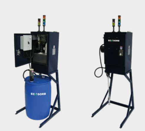
75 CFM Innovative Vapor Phase Technology allows for implementation without need for added water.

Odor mitigation solutions can also be placed at indoor facilities with roof exhaust.